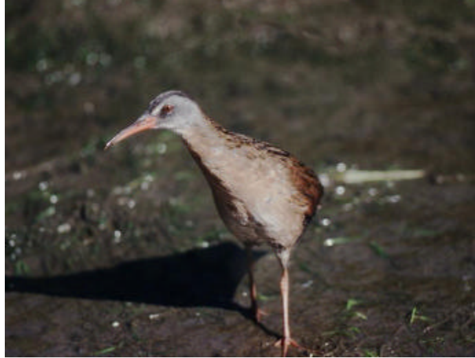
Fig. 1. The Virginia Rail was a common but secretive inhabitant of the tidal marshes of the Connecticut River.

Although there is great local concern for these habitats, in many instances the birds that live in them are poorly known. As most birdwatchers know, birds of tidal marshes are notoriously difficult to observe, because many (such as the Virginia Rail in Fig. 1) are very secretive. Many also have the bad habit of getting up very early, which means that investigations must begin well before first light. And, of course, wading around in soggy, cold, smelly, sometimes even dangerous tidal marshes is rather less than the most enjoyable activity for a spring morning. Despite such drawbacks, we initiated a series of bird counts at nine sites, and in the process field tested a new bird survey protocol which is being developed U.S. Fish and Wildlife Service.